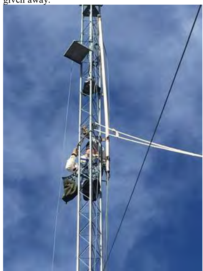
Rush on the N5DO tower as it is dismantled.

and tower were taken apart and are being sold or given away.